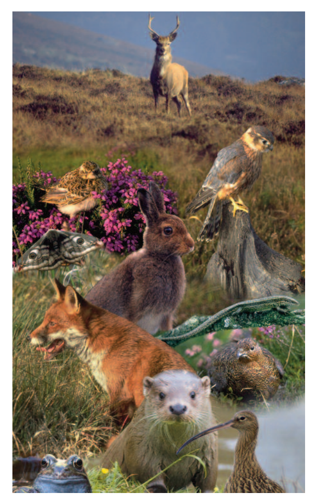
6 Peatland Passport: Ireland

As one of Ireland's largest carbon stores, peatlands play a significant role in the regulation of greenhouse gas emissions and global climate. Additionally peatlands have many other important functions and values including water regulation - especially flood control, extraordinary biodiversity, and the provision of a livelihood for communities. Peatlands are also used for forestry, agriculture as a source of peat for energy and horticulture and they provide turf for household heating. Unfortunately despite the benefits, Irish peatlands have been heavily over-utilised and degraded.