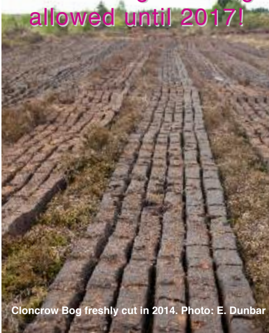
Cloncrow Bog freshly cut in 2014.

The draft Raised Bog SAC Management Plan and the Raised Bog NHA Review were published by Government in January this year. IPCC were very disappointed to see the political decision included in these documents to allow turf cutting to continue on the Natural Heritage Area Bogs until 2017 under permit. Unfortunately this move seems to have unleashed a brown gold rush across the midlands. Cloncrow Bog NHA in Co. Westmeath was cut for the first time in years and on Monivea Bog SAC in Co. Galway, 11 diggers cut 80 plots of turf. IPCC have reported both events to the local Authorities concerned and to the Peatlands Council.