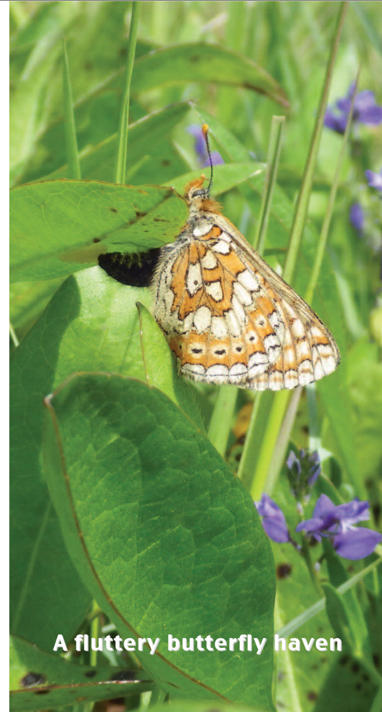
A fluttery butterfly haven