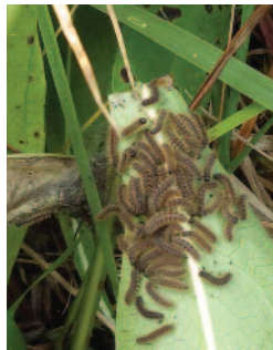
Visitors are welcome to Lullymore West but try to avoid trampling the ground nests of the Marsh Fritillary