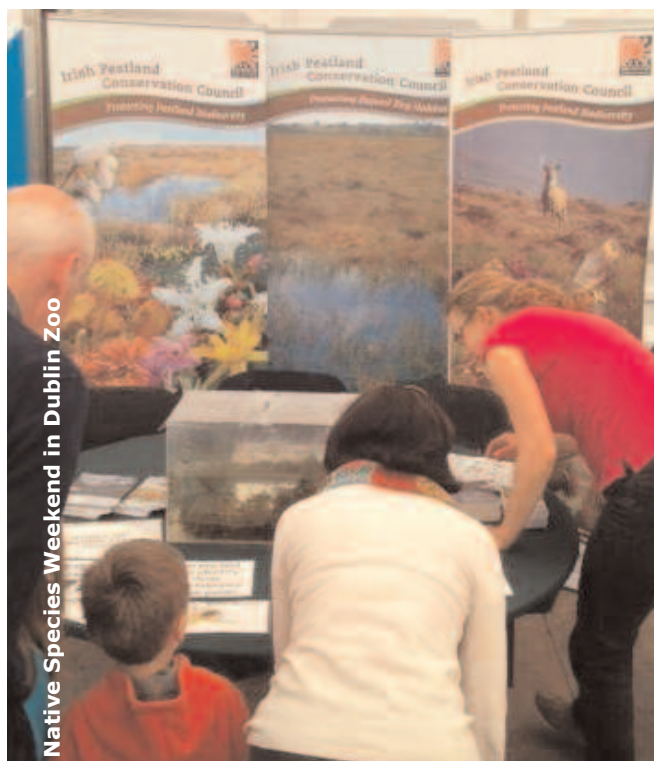
Native Species Weekend in Dublin Zoo