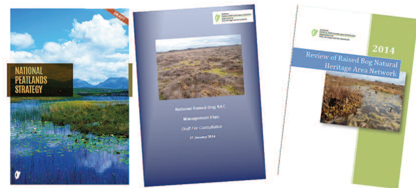
Peatland Strategies published by the Irish Government for public consultation

During 2013, IPCC responded to 11 site issues documented in the table inset. We made submissions to 13 policy documents (see table inset). Further joint submissions were made as part of our representation on the Environmental Pillar including the National Strategy for Education for Sustainable Development, the Rural Development Plan 2014-2020, the EPA research into Gas Fracking and the Pillar Policy on the Aarhus Convention. The release at the year end of the Draft Peatland Strategy for Ireland by the Peatlands Council was a highlight. IPCC participated in the development of the Strategy commenting on each draft produced.