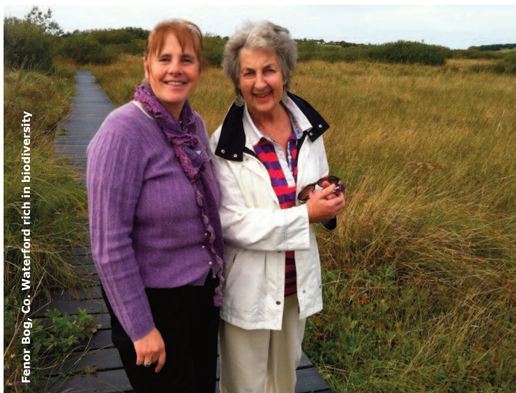
Fenor Bog, Co. Waterford rich in biodiversity