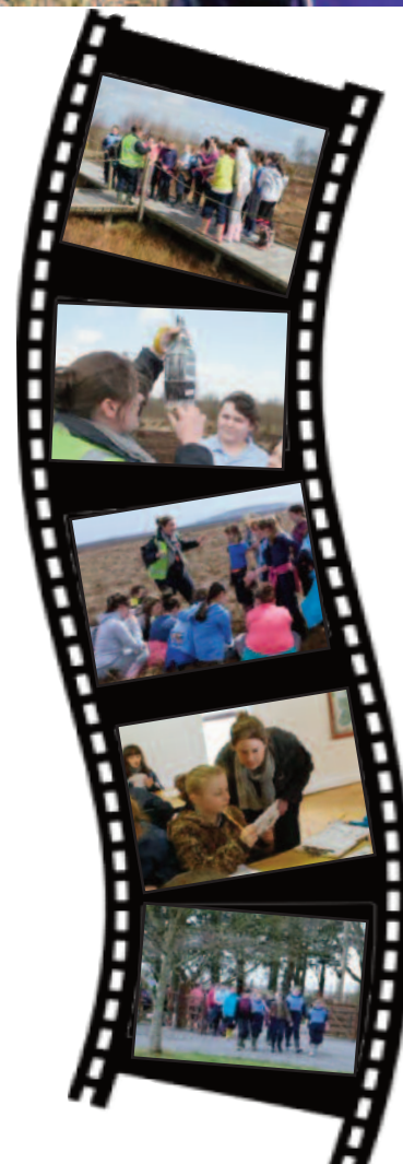
Scenes from the DPSM film about the Bog of Allen Nature Centre