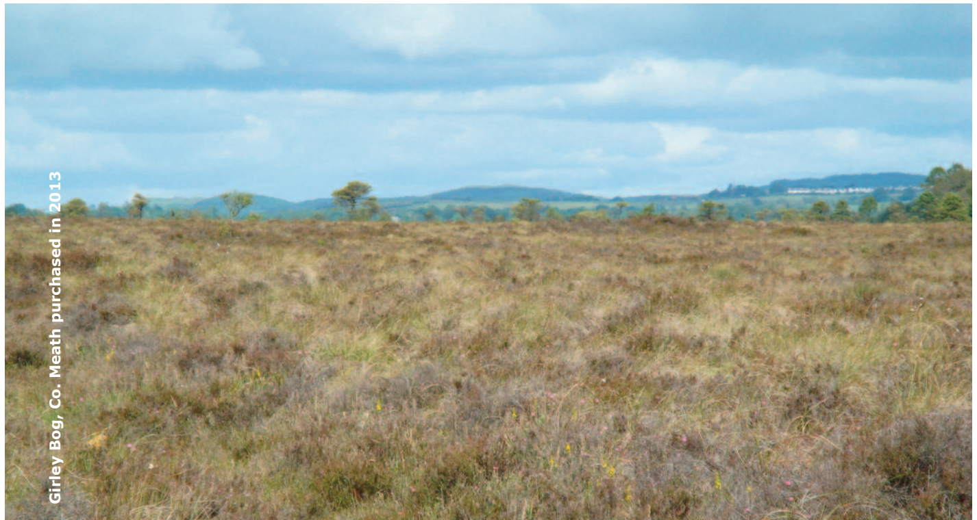
Girley Bog, Co. Meath purchased in 2013

The Irish Peatland Conservation Council's (IPCC) mission is to conserve a representative portion of the peatlands of Ireland for future generations to enjoy. We run the national Save the Bogs Campaign, we own four peatland nature reserves in Kildare, Meath and Waterford and we manage the Bog of Allen Nature Centre, which is open to visitors and school groups. We provide an extensive information service on our web site at www.ipcc.ie . IPCC have five members of staff and is supported by 100 volunteers. Four thousand individuals subscribe to our campaign. CHY6829