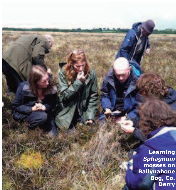
Learning Sphagnum mosses on Ballynahone Bog, Co. Derry

collaborate on developing great peatland experiences at each site to visit in the passport. With the support of the Environmental Protection Agency, IPCC organised a peatland educators conference to launch the Peatland Passport and to network on ideas and methods to educate about peatlands.