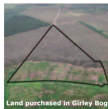
Land purchased in Girley Bog