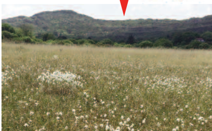
Coad Bog on the Ring of Kerry. See blanket bog in the wild west of Ireland and fantastic mossy lawns.