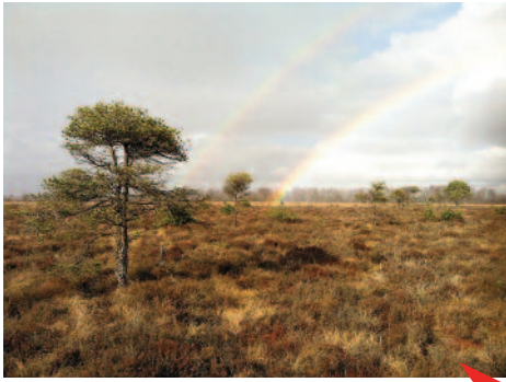
Girley Bog in Ireland's Ancient East is 10,000 years old. Take the Loop Walk to see raised bog and bog woodland habitats.