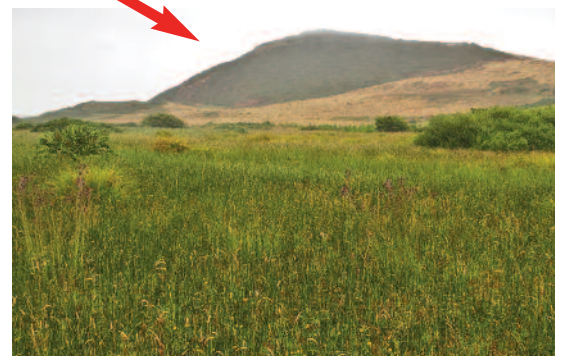
Fenor Bog along the "Copper Coast Geopark" of Waterford. See quaking wet fen and a wild flower sanctuary.