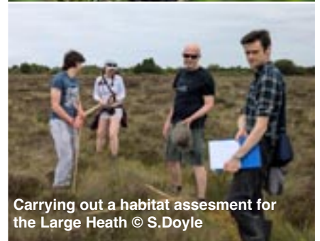
Carrying out a habitat assesment for the Large Heath