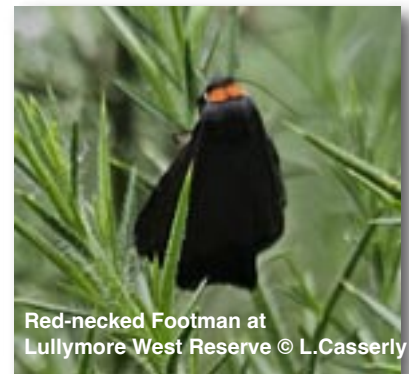
Red-necked Footman at Lullymore West Reserve

The Red-necked Footman ( Atolmis rubricollis ) has long black wings and a red collar. Primarily found in woodland, it is on the wing in June and July and may fly during both night and day. The caterpillars feed on lichens and algae growing on trees. This distinctive moth was spotted in a scrubby area at Lullymore West and was a new record for the reserve.