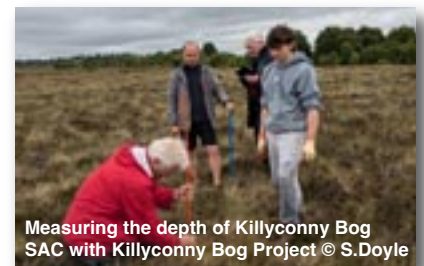
Measuring the depth of Killyconny Bog SAC with Killyconny Bog Project

It's great to be working with Killyconny Bog Project again to estimate the carbon stored in Killyconny Bog SAC. Last year, IPCC worked with the group to estimate the carbon stored in one lobe of the bog which was estimated at 178,399tC. We have now completed peat depth measurements for the second lobe across three days of peat probing with volunteers from Killyconny Bog Project. The centre of the lobe was measured at over 13.6m deep!