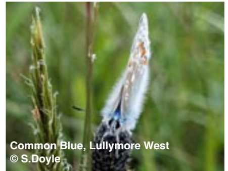
Common Blue, Lullymore West