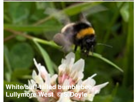
White/buff-tailed bumblebee, Lullymore West