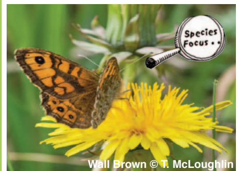
Wall Brown

An IPCC supporter encountered the Wall Brown ( Lasiommata magera ) on Lullymore West this May. The butterfly was recorded previously in 2018 and 2013 with only a single butterfly each time. The Wall Brown is very alert and difficult to approach from a close distance, however if you do the butterfly is mainly pale orange with grayish-brown markings and black eyespots.