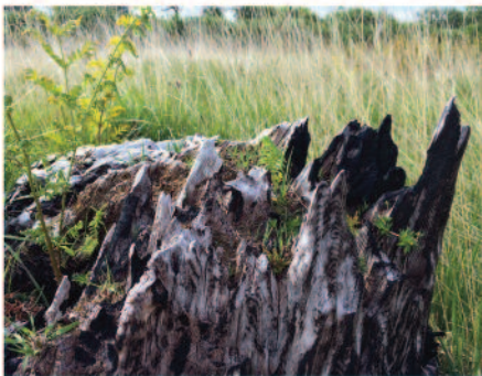
4000 year old pine stumps are present throughout the bog, black because of burning in the past