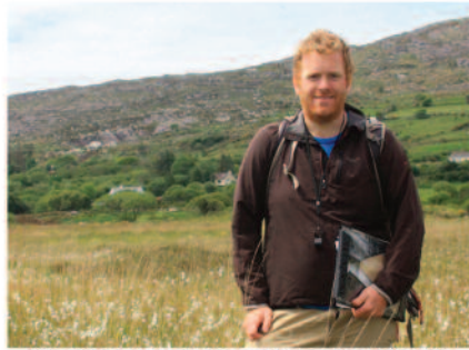
Expert Rory Hodd recorded a massive 69 species of moss and liverwort on Coad bog