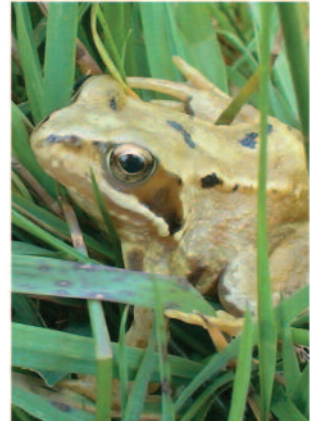
Frogs were recorded on Coad Bog in damp and wet areas