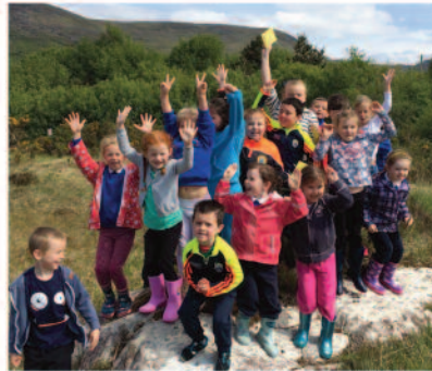
The students of Caherdaniel National school enjoyed an educational visit to Coad bog