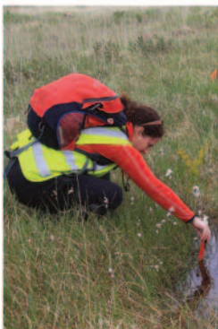
The pH on Coad Bog ranged from 5.1 in a bog pool to 6.8 in the stream