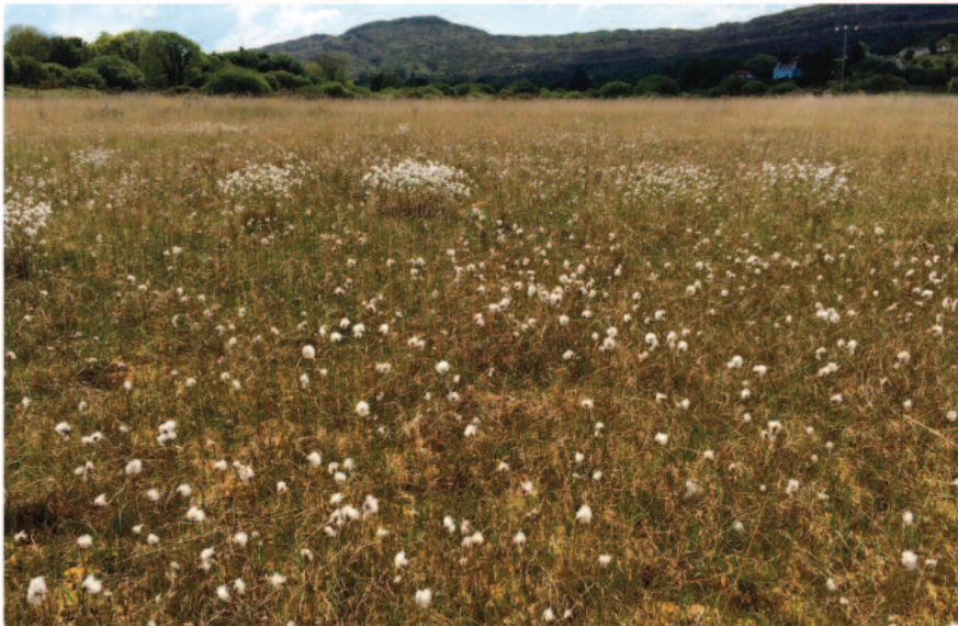
13 different habitats were found on the 10 acre site. These included wet bog, grassland, rocky outcrop, bog ditch and stream. The stream was the most diverse containing 22 different species