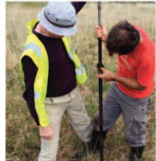
4m depth of peat was recorded in Coad Bog. The bog formed directly on Old Red Sandstone rocky soil