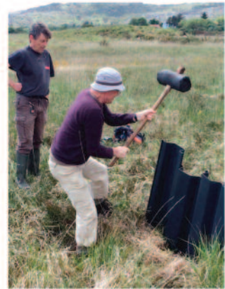
304 working hours were contributed to the BioBlitz from 28 different volunteers