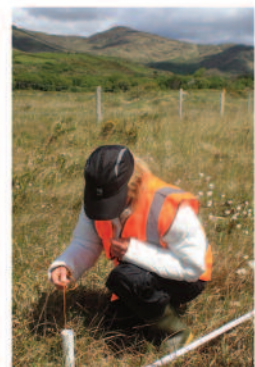
Water levels in Coad Bog ranged from 1.5cm to 75cm below the surface

Irish Peatland Conservation Council, Lullymore, Rathangan, Co. Kildare, R51 V293