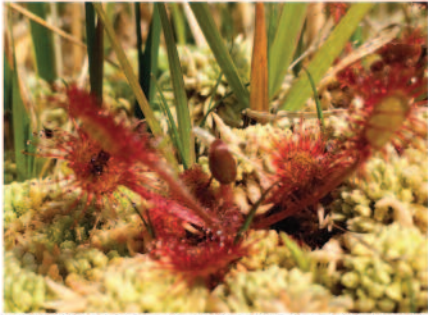
Over 200 species of plant, bird and animal were recorded on Coad Bog