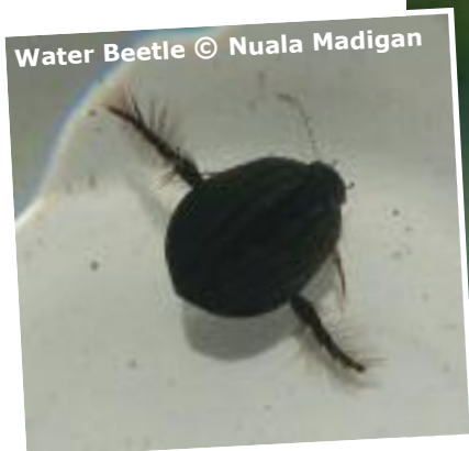
Water Beetle © Nuala Madigan