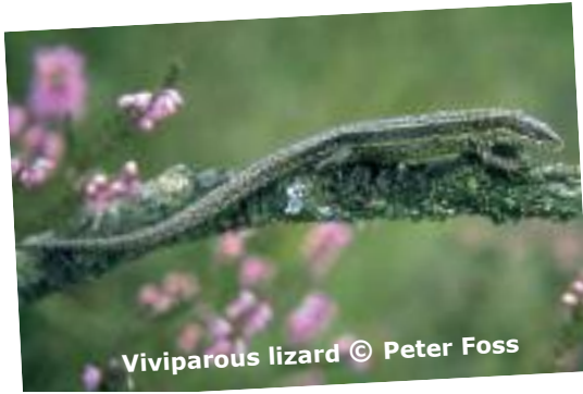
Viviparous lizard