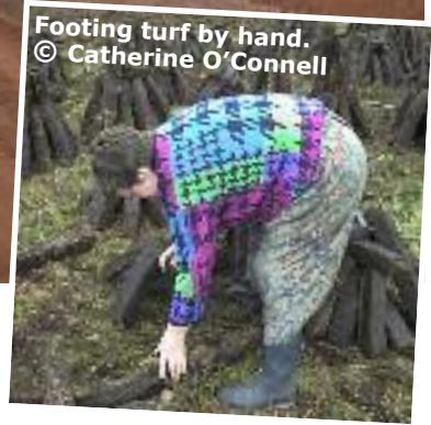
Footing turf by hand.