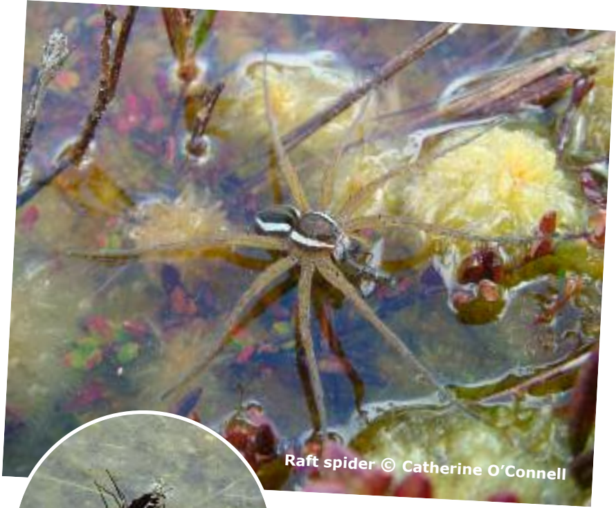
Raft spider © Catherine O'Connell