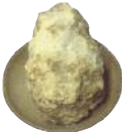
Bog butter

as 390 BC - the Iron Age. Bog butter is another common find; it is thought that local people would dig a hole in the bog and store their butter and other perishables in it to keep them cold and fresh. Remains of the great Irish elk ( Megaloceros giganteus ) have also been found excellently preserved in bogs. This impressive animal lived approximately 12,000 years ago.