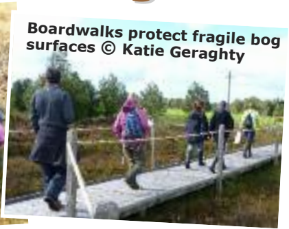
Boardwalks protect fragile bog surfaces

The Irish Peatland Conservation Council (IPCC) is an environmental NGO. Its mission is to conserve a representative sample of Ireland's peatlands for future generations to enjoy. The IPCC has been working to save bogs for over 30 years, and has run numerous projects around the country to achieve our goal. Today, just 23% of Ireland's peatlands are still of conservation value, and it is important that these habitats are protected and conserved.