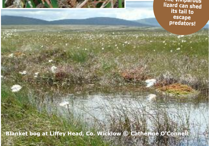
Blanket bog at Liffey Head, Co. Wicklow

The viviparous lizard can shed its tail to escape predators!