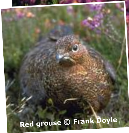
Red grouse