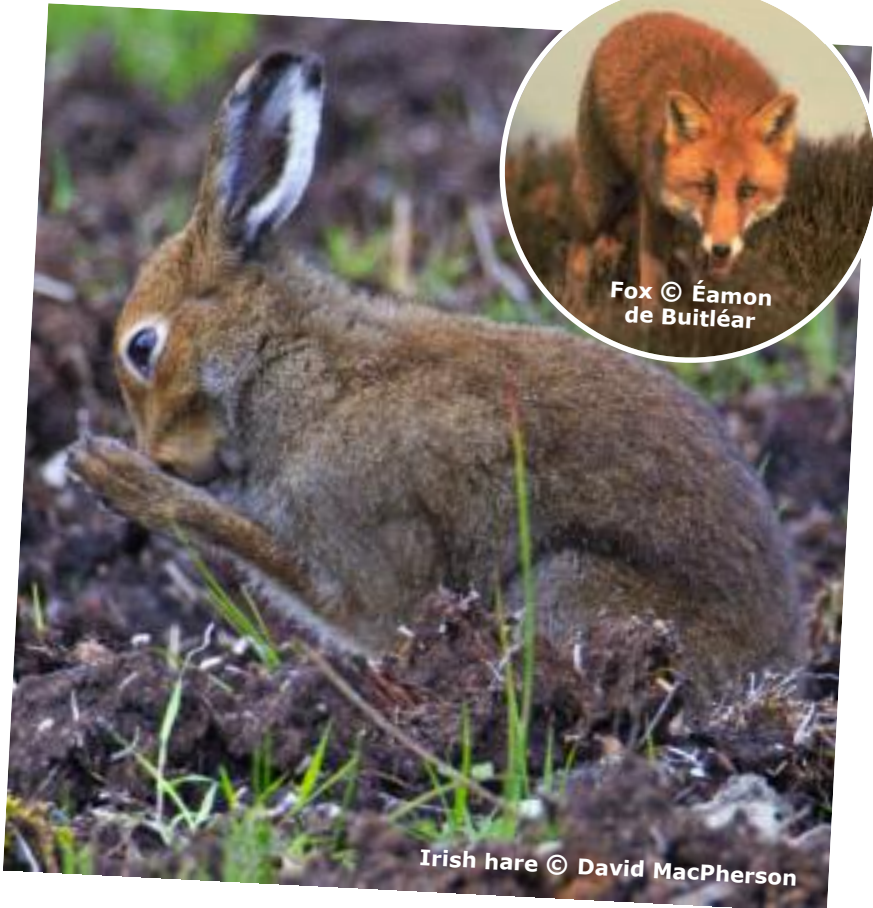
Irish hare

hummocks on the bog surface. This means they can live, breed and shelter on the bog in relative safety. Foxes ( Vulpes vulpes ), badgers ( Meles meles ) and shrews ( Sorex minutus , Crocidura russula ) make occasional foraging journeys to the bog, but they do not live there. Red deer ( Cervus elaphus ) graze blanket bogs in summer.