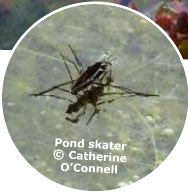
Pond skater