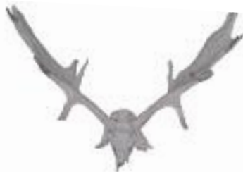
Giant Irish elk antlers