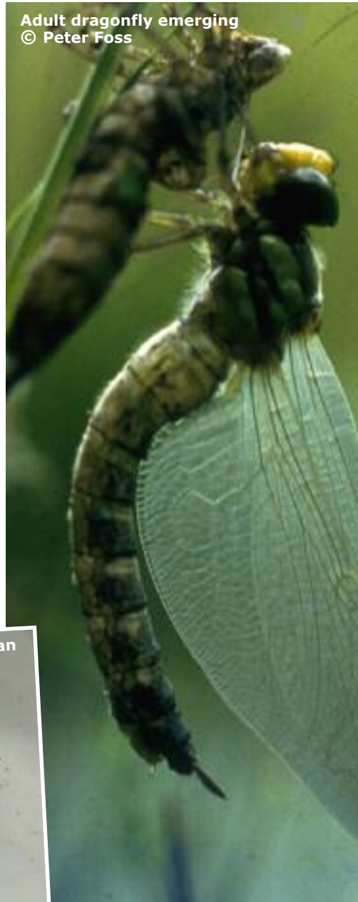
Adult dragonfly emerging

There is a great diversity of life within bog pools, and many other minibeasts can be found here, including water beetles, water boatmen, pond skaters, freshwater hoglice, fly larvae, freshwater shrimps and tadpoles.