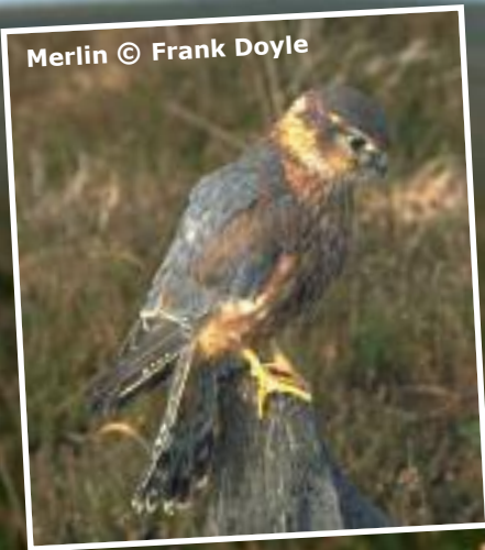
Merlin

Bogs are a fantastic hunting ground for Ireland's birds of prey. The rare and protected Hen Harrier makes its nest on the bog surface. They will hunt and feed on ground dwelling birds and mammals. The Merlin is Ireland's smallest bird of prey. They can often be seen