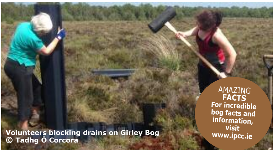
Volunteers blocking drains on Girley Bog

AMAZING FACTS For incredible bog facts and information, visit www.ipcc.ie