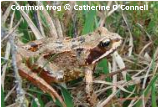
Common frog

Frogs ( Rana temporaria ) are the most common animal found on bogs. Frogs are amphibians, hunting on the drier bog surface but returning to water to breed.