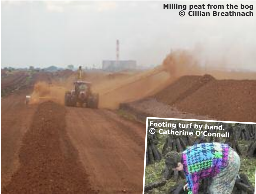
Milling peat from the bog