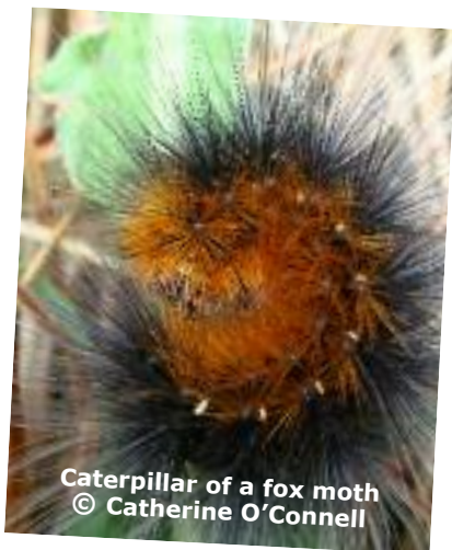
Caterpillar of a fox moth

AMAZING FACTS Marsh fritillary will only feed on the Devil's-bit scabious