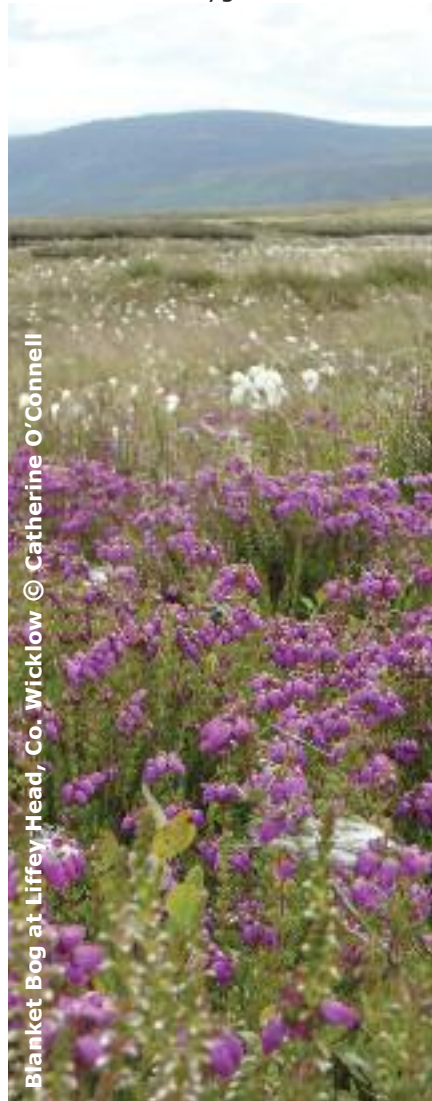
Blanket Bog at Liffey-Head, Co. Wicklow

Bogs are wetlands made of a combination of peat, plants and water. Peat is the result of the accumulation of partially decayed plants over thousands of years. The dead plants do not rot because they grow in waterlogged conditions where there is little oxygen.