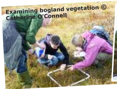
Examining bogland vegetation