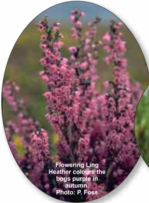
Flowering Ling Heather colours the bogs purple in autumn.

Quirky Fact If you find Heather with white flowers you'll be in for some good luck.