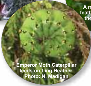
Emperor Moth Caterpillar feeds on Ling Heather.