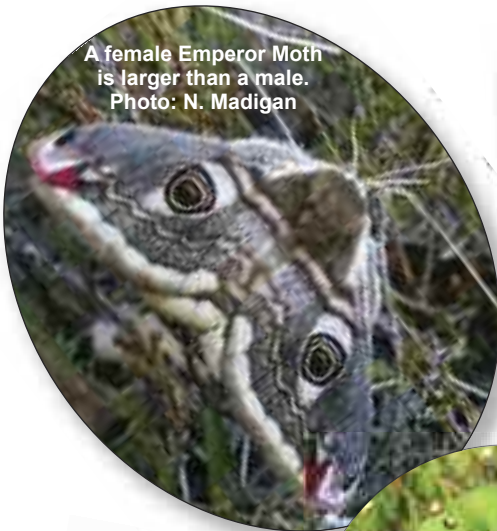
A female Emperor Moth is larger than a male.

Adult Emperor Moths do not feed. Their sole purpose is to find a mate and reproduce. Once the female emerges from her cocoon she releases pheromones, a chemical scent, then sits and waits. The male Emperor Moth can be seen flying over the bog surface in a zig zag pattern trying to locate the females' irresistible scent.