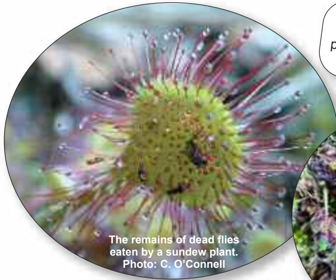
The remains of dead flies eaten by a sundew plant.

Quirky Fact On average a Sundew plant can trap up to five insects per month.