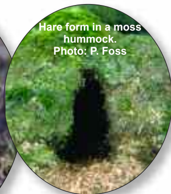
Hare form in a moss hummock.