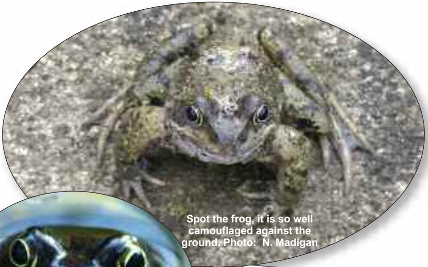
Spot the frog, it is so well camouflaged against the ground.

The colourful pattern on the frog's skin helps to disguise it from enemies such as rats, herons and hedgehogs. A frog can also make it's skin become darker or lighter to match it's surroundings. This camouflaging colour change takes about two hours to effect.