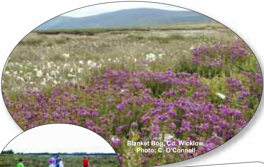
Blanket Bog, Co. Wicklow.

Bogs are valuable as an ecosystem and provide many services including provisioning, cultural, regulating and supporting. Their wildlife demonstrates wonderful and unique adaptations enabling them to survive in one of Ireland's wettest, windswept landscapes. While the dead plants that have built the bog store carbon helping Ireland meet climate change targets.