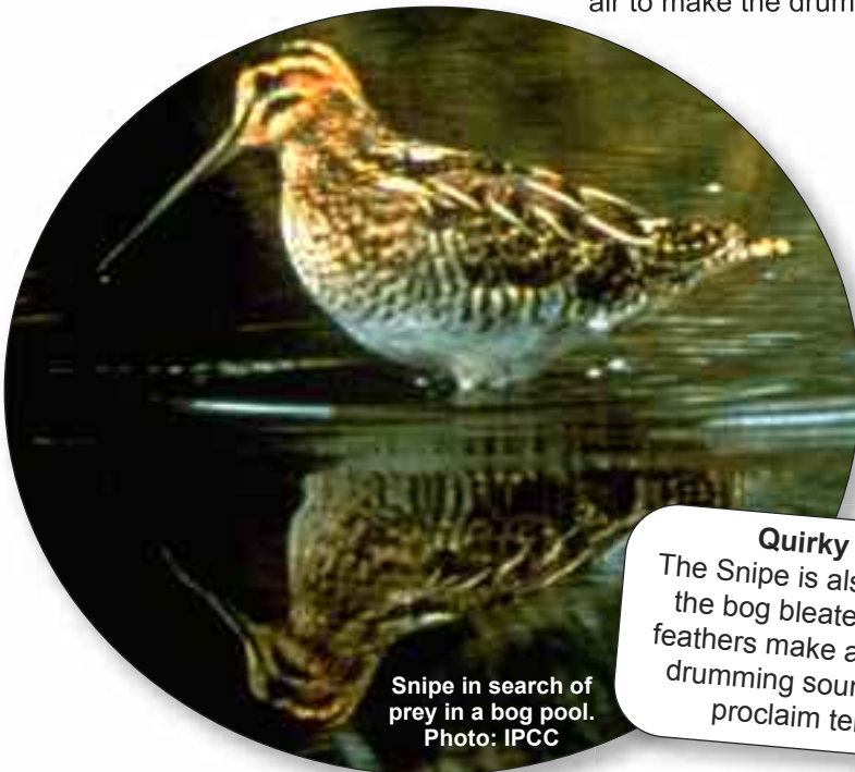
Snipe in search of prey in a bog pool.

The Snipe makes an amazing drumming sound to mark its breeding territory. It sticks two of its tail feathers out from the tail. These vibrate with the air to make the drumming sound.