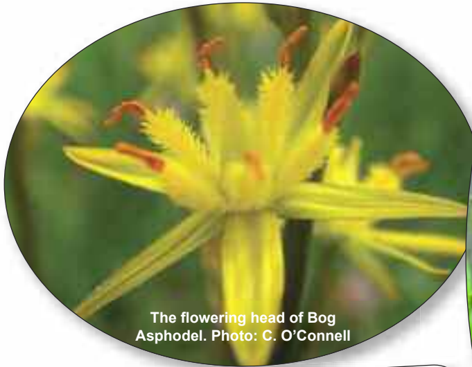
The flowering head of Bog Asphodel.