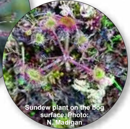
Sundew plant on the bog surface.

Quirky Fact On average a Sundew plant can trap up to five insects per month.