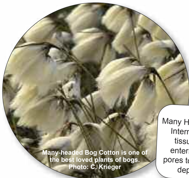
Many-headed Bog Cotton is one of the best loved plants of bogs.

Within the stem of Bog Cotton internal air channels allow oxygen move from the surface of the bog to the roots deep below the peat.