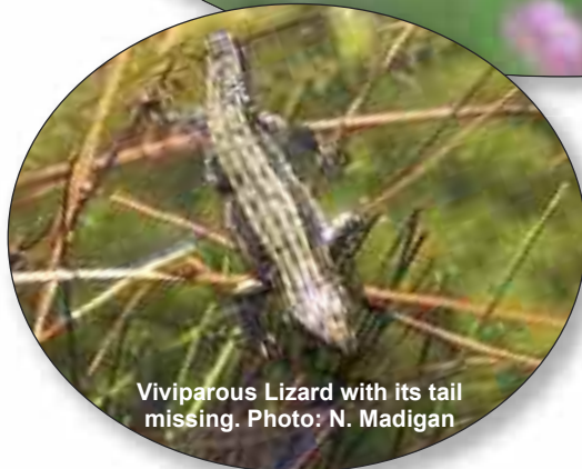
Viviparous Lizard with its tail missing.

Quirky Fact The Viviparous Lizard can drop the end of its tail off to escape predators - allowing it to find shelter and leaving its predator with only a wriggling tail for lunch! The tail can grow again.