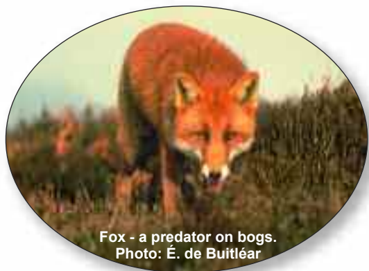
Fox - a predator on bogs.

The bogs of Ireland have been valued in the past for the peat, often called brown gold, stored beneath their surface. Today we are not the Ireland of years gone by. We have alternative greener technologies available to heat homes and to generate electricity rather than using turf or milled peat. When choosing a compost to improve garden soil we can choose peat free. This booklet is about bogland biodiversity and presents some quirky facts about how this wildlife has adapted to life on the wet and wild bogs of Ireland.