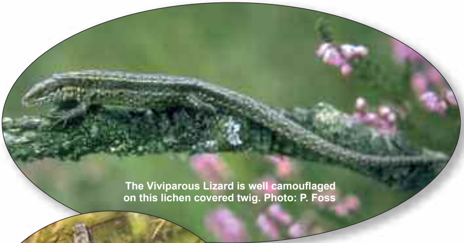
The Viviparous Lizard is well camouflaged on this lichen covered twig.

Similar to other reptiles their body is covered in scales that blend in with the surrounding landscape, these scales help the lizard to camouflage itself from predators.