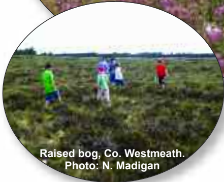
Raised bog, Co. Westmeath.

Quirky Fact Bogs are climate change warriors. They cover about 3% of the earth's land surface area, yet they store roughly 30% of all land based carbon.