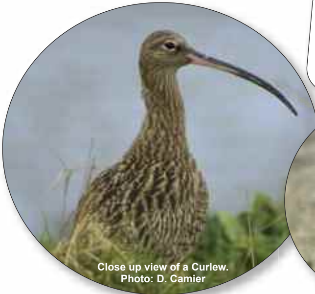
Close up view of a Curlew.

Curlew spend most of the year along the coastline of Ireland but move to Irish bogs in the summer to nest and rear their young.