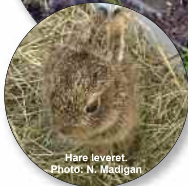
Hare leveret.