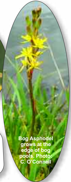
Bog Asphodel grows at the edge of bog pools.