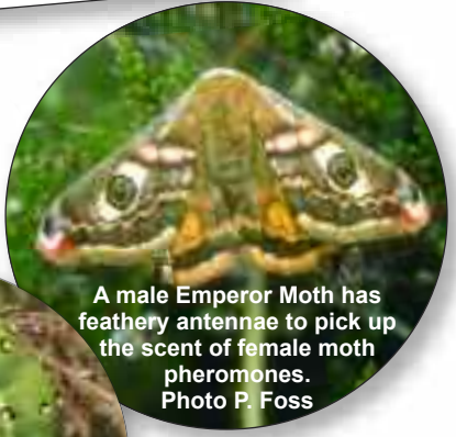
A male Emperor Moth has feathery antennae to pick up the scent of female moth pheromones.

Quirky Fact A male Emperor Moth can detect a female up to a kilometer away using his feathery antennae.