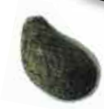
Silk Emperor Moth Cocoon.