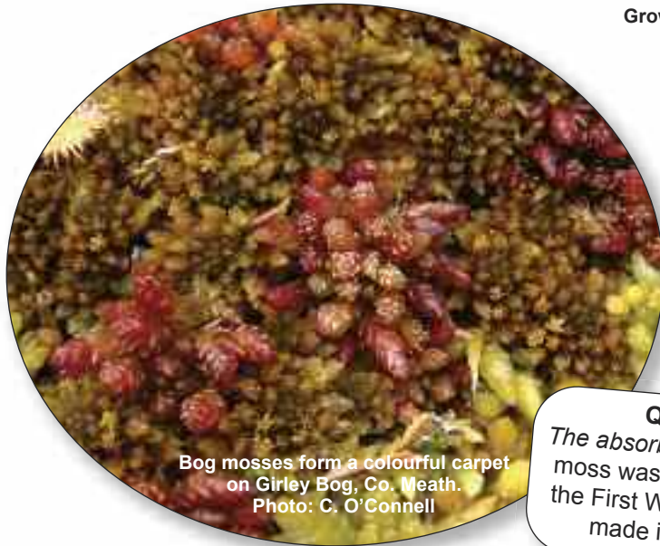
Bog mosses form a colourful carpet on Girley Bog, Co. Meath.