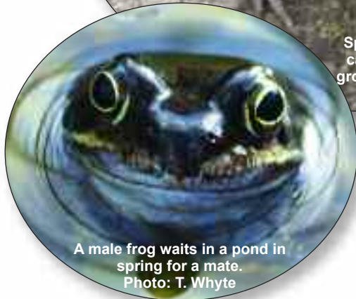
A male frog waits in a pond in spring for a mate.