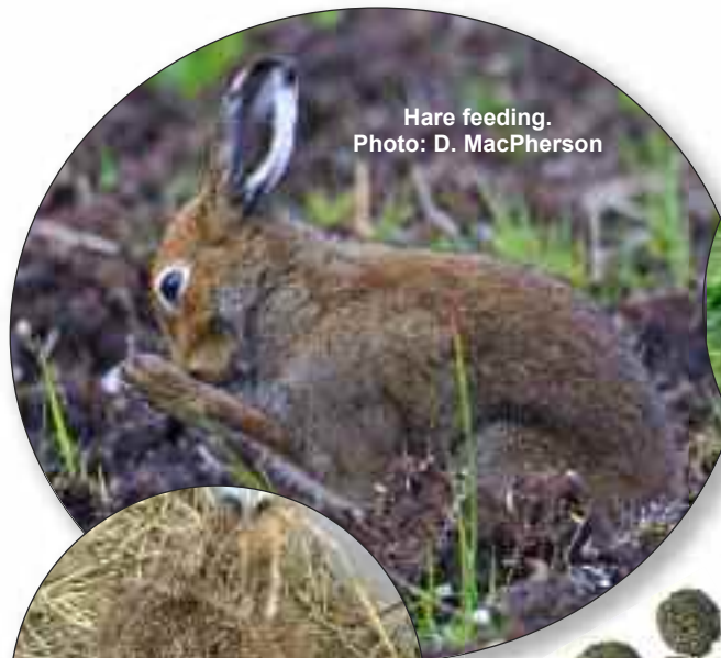
Hare feeding.

Female hares are larger than males and therefore dominate males throughout the year. During the mating season, in March, it is not uncommon to see Hare's 'boxing' one another. Usually it is a female Hare warning a male Hare to stay away. This is also where the saying 'Mad as a March Hare' comes from.