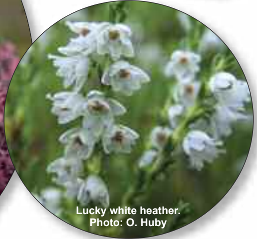
Lucky white heather.

Species name: Ling Heather Calluna vulgaris Fraoch Coiteann