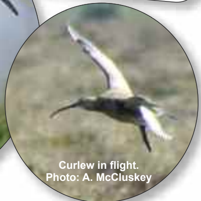
Curlew in flight.