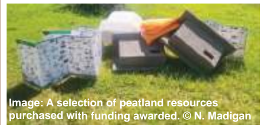
Image: A selection of peatland resources purchased with funding awarded.

The IPCC acknowledge funding from and thank Kildare County Council for supporting volunteers at the Bog of Allen Nature Centre. Funding awarded has been allocated for new swift boxes, pond dipping equipment and Marsh Fritillary butterfly nest markers.