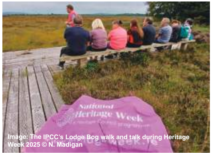
Image: The IPCC's Lodge Bog walk and talk during Heritage Week 2025

For National Heritage Week the IPCC have organised a series of events including offering free admission to the Bog of Allen Nature