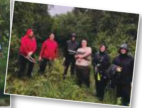
Image: Volunteer groups on Lullymore West Bog from the Ismaili Civic and Diageo supporting to maintain habitat for the Marsh Fritillary butterfly

The IPCC are grateful to all those individuals and groups who give their time to support the IPCC with peatland habitat management and species monitoring through volunteering. We were delighted to welcome groups from both Ismaili Civic and Diageo to our Lullymore West Bog nature reserve, in June. Guided by the IPCC Conservation and Education Officers both groups supported with maintenance of